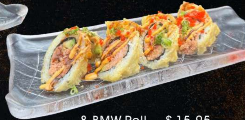
8. BMW Roll $ 15.95

In: Shrimp Tempura, cucumber, Avocado Out: kani, crunch, Tobiko on the Top Sauce: spicy mayo, eel sauce, mango