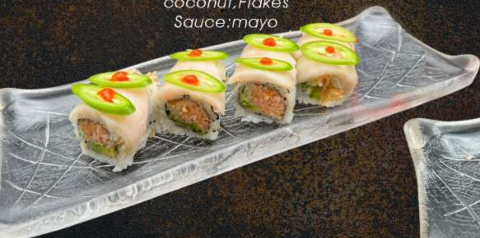
13. Volcano $ 17.95

In: Shrimp Tuna, spicy yellowtail, Avocado Out: spicy crab, crunch Sauce: spicy mayo