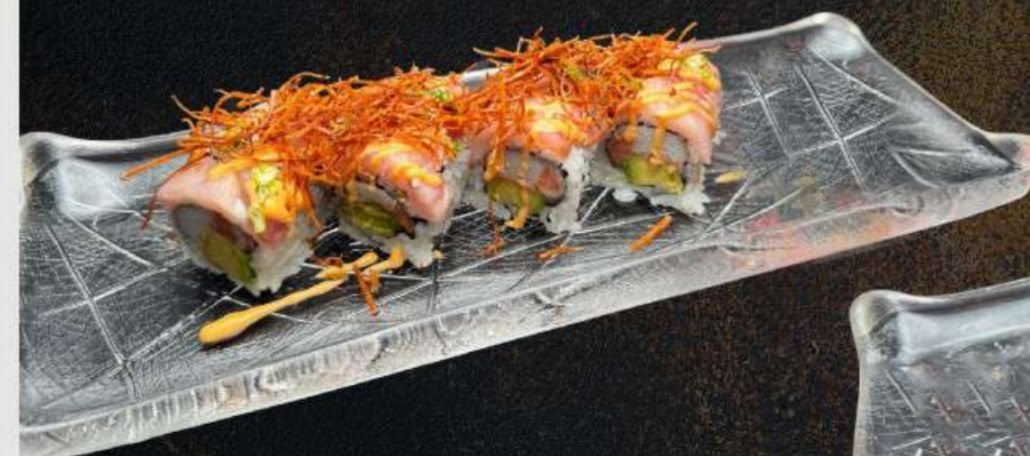
21. Tsunami $ 18.95

In: Shrimp Tempura, kani, salmon Out: scallops, Tobiko, scallions Sauce: eel sauce, Yuzu sauce