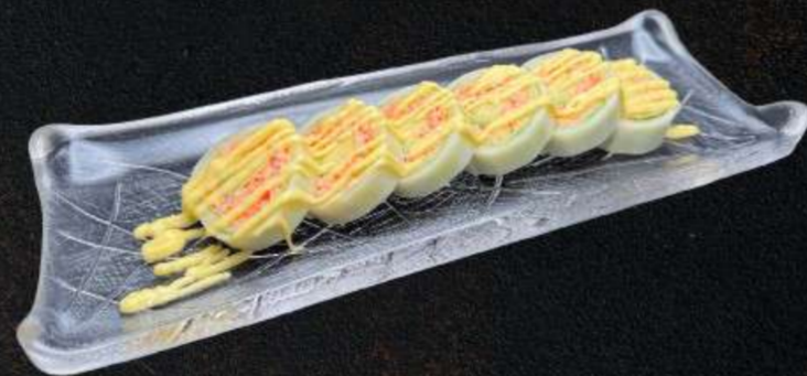
25. Snow crab Naruto $ 15.95 In: snow crab, crunch, Avocado, Asparagus Out: cucumber wrap Sauce: mango sauce