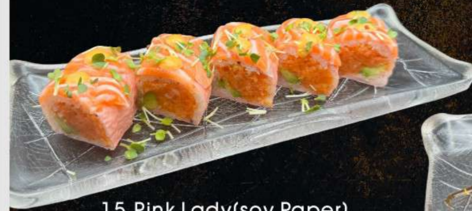
15. Pink Lady (soy Paper) $ 17.95

In: cucumber, crunch, Tobiko, spicy mayo Out: Fresh Tuna, Jalapeno, scallion Sauce: Yuzu sauce