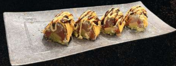
28. Golden age $ 18.95 In: salmon, Tuna, yellowtail, Tamago, Avocado Out: Torched cheddar, sesame Sauce: mayo, eel sauce