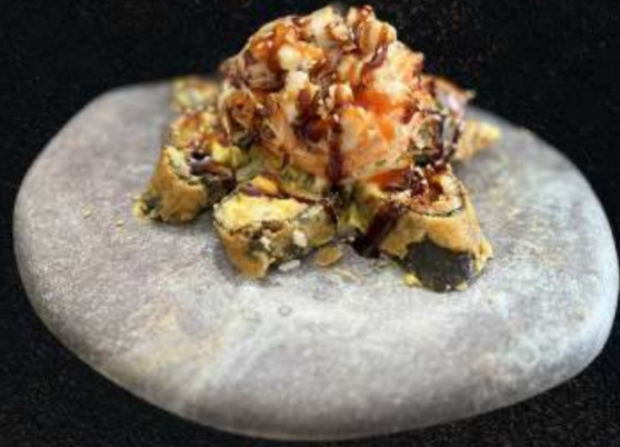
27. Fire Mountain $ 19.95 In: Tamago, cheddar, yellowtail, Avocado, (deep Fried) Out: snow crab, chopped scallops, with Toasted, sesame Sauce: Thai chili, eel sauce