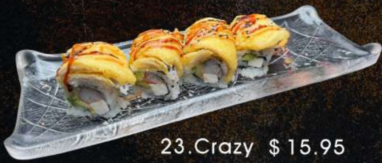
23. Crazy $ 15.95 In: kani, cheese, Avocado Out: Tempura white Tuna, sesame Sauce: spicy mayo, eel sauce