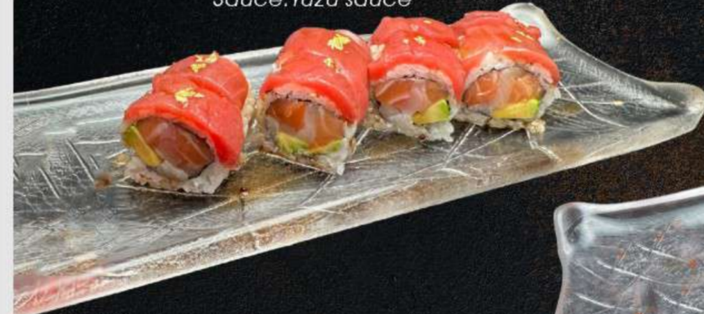
19. Golden Treasure $ 19.95

In: soft crab Tempura, cheese, cucumber, Avocado Out: Scallions, Tobiko Sauce: eel sauce