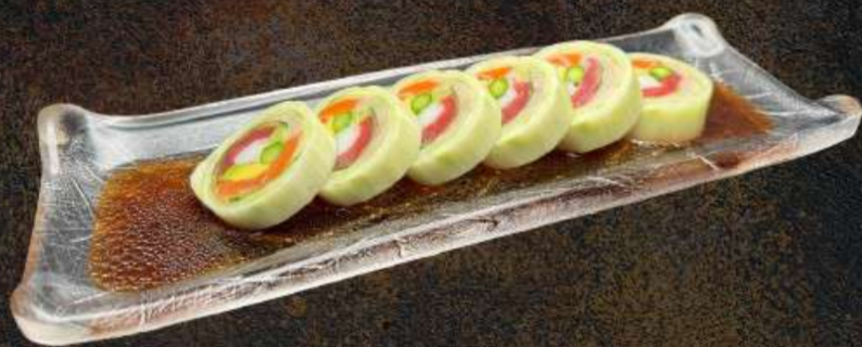
24. Naruto $ 17.95 In: 3 kinds Fresh Fish, Avocado, kani, Asparagus Out: cucumber wrap Sauce: Yuzu sauce