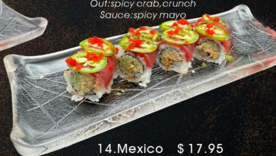
14. Mexico $ 17.95

In: spicy crab, Avocado Out: white Tuna, Jalapeno Sauce: sriracha