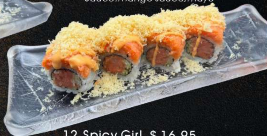
12. Spicy Girl $ 16.95

In: Shrimp Tempura, cheese, Avocado Out: snow crab, crunch, coconut, Flakes Sauce: mayo