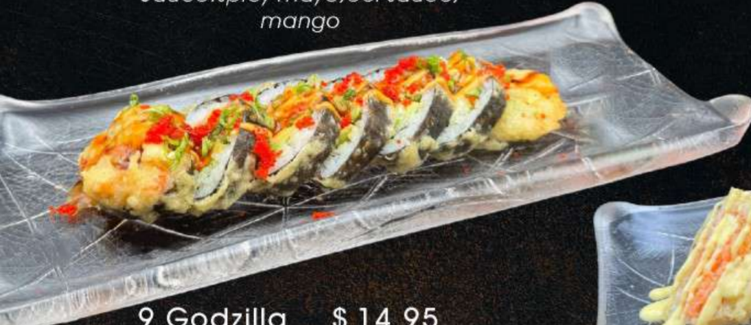
9. Godzilla $ 14.95

In: Spicy Tuna, crunch, avocado, (deep Fried) Out: Tobiko, scallions Sauce: spicy mayo, eel sauce