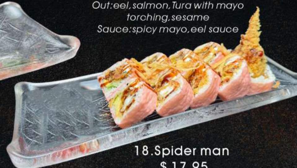
18. Spider man $ 17.95

In: Tuna, chopped, lobster Out: Avocado, salmon, Fried Garlic Sauce: Yuzu sauce