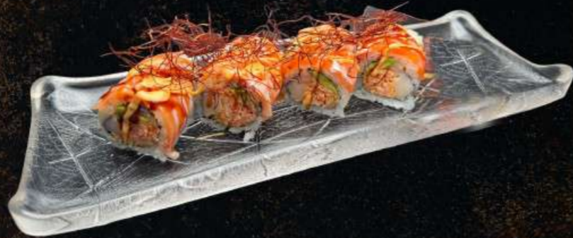
26. Fire Storm $ 18.95 In: white Tuna, Avocado, spicy crab Out: salmon, shredded papper Sauce: spicy mayo, eel