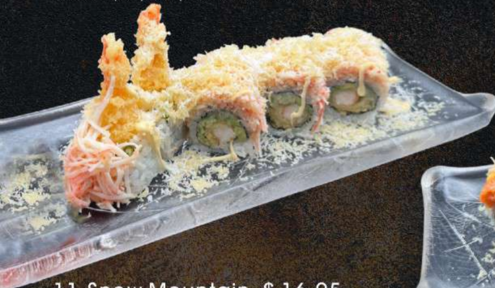
11. Snow Mountain $ 16.95

In: Snow crab, cream cheese, crunch, (deep Fried) Out: coconut Flakes Sauce: mango sauce, mayo