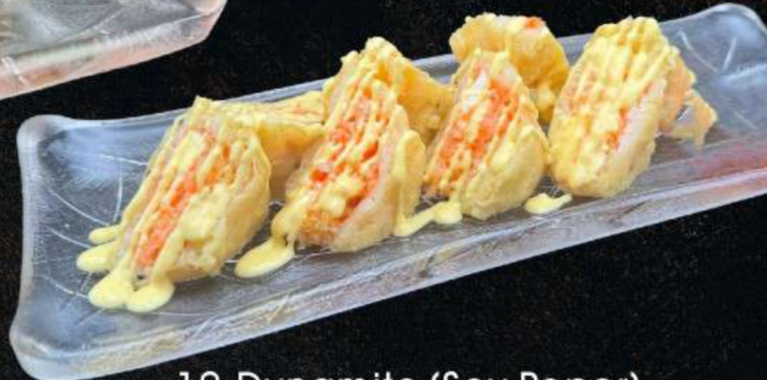
10. Dynamite (Soy Peper) $ 17.95

In: Salmon, cream, cheese, Avocado, asparagus, kani, (deep Fried) Out: Tobiko, scallion Sauce: spicy mayo, eel sauce, Thai chili