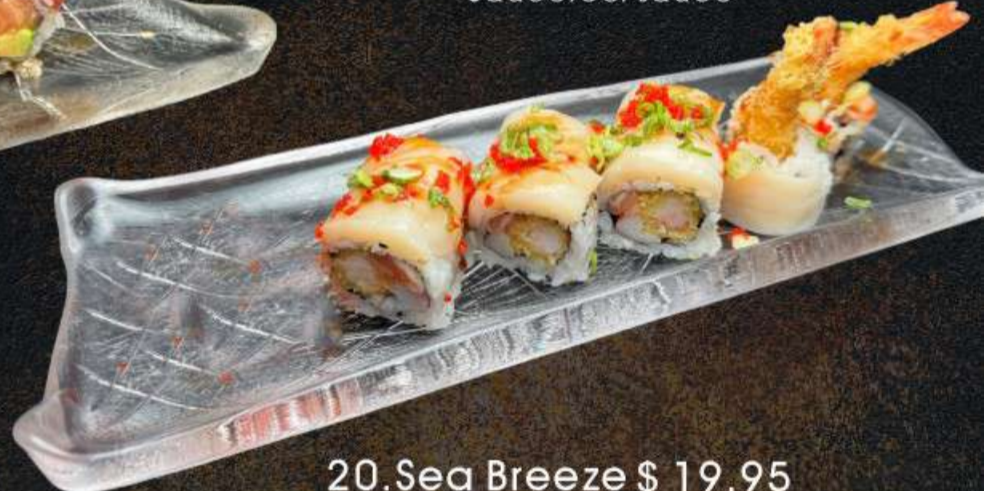
20. Sea Breeze $ 19.95

In: salmon, Yellow Tail, Avocado Out: Tuna, Edible Gold Foil Sauce: spicy mayo, Yuzu sauce