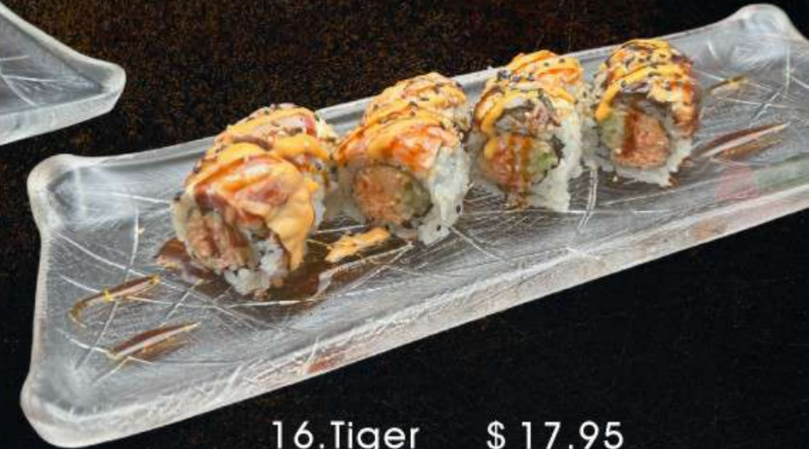
16. Tiger $ 17.95

In: spicy salmon, crunch, avocado Out: salmon, Tobiko, Kaiware Sauce: spicy mayo