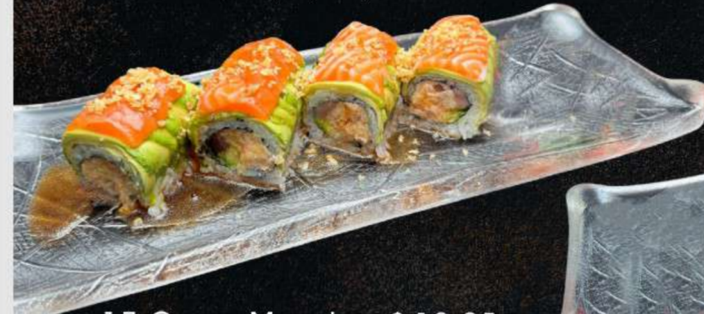
17. Green Meadow $ 19.95

In: spicy crab, crunch, cucumber Out: eel, salmon, Tuna with mayo torching, sesame Sauce: spicy mayo, eel sauce