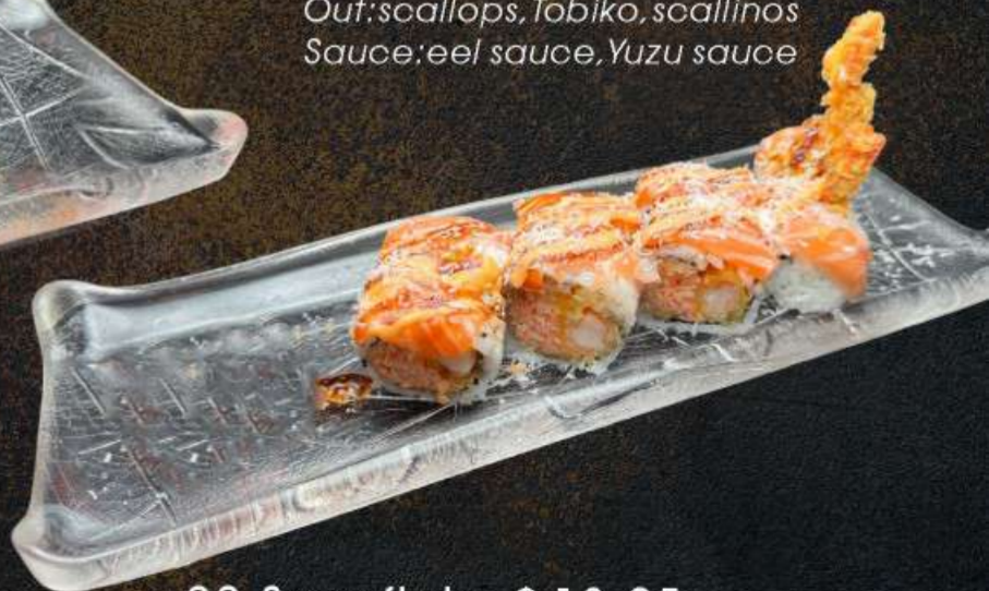
22. Snowflake $ 18.95

In: kani, salmon, Avocado Out: Yellowtail, scallions, crispy yam Flakes Sauce: spicy mayo