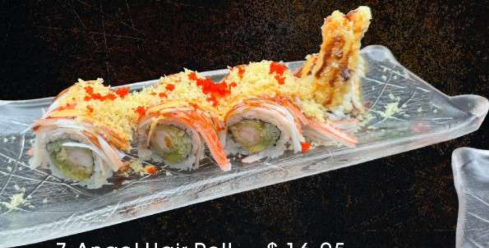
7. Angel Hair Roll $ 16.95

In: Shrimp Tempura, cucumber, Avocado Out: kani, crunch, Tobiko on the Top Sauce: spicy mayo, eel sauce, mango